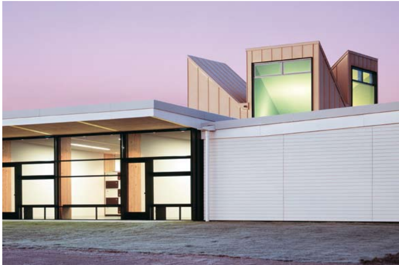
↑ | North-east exterior view ← | Diagrammatic plan sketch