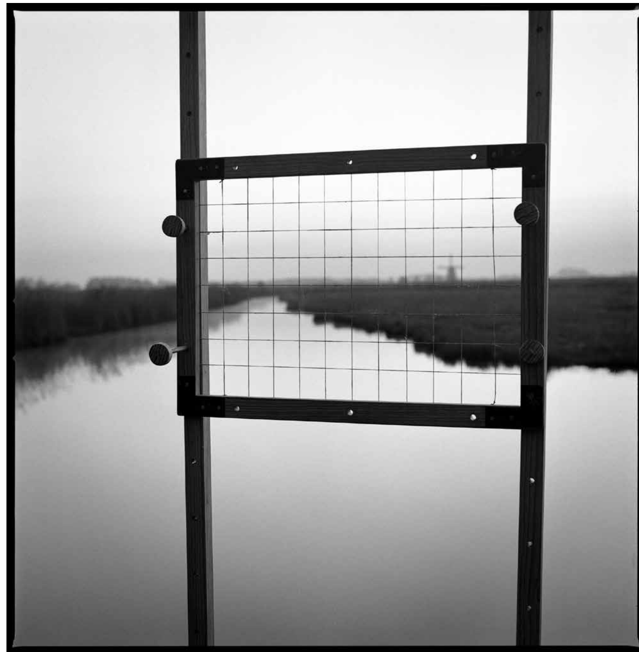
Drawing lessons Belgium Académie Royale des Beaux-Arts Van Gogh participated in classes there for nearly a year.