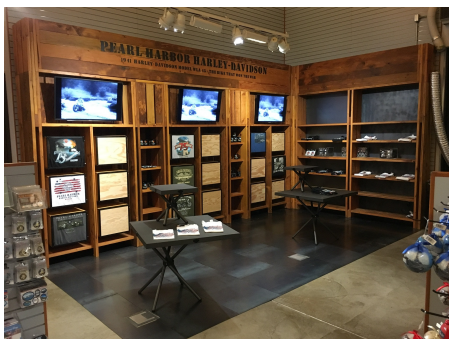
Pearl Harbor Harley Davidson Client: JN Exotics (2016)