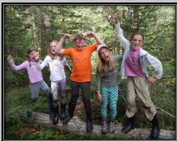
Summer Camp is always a great time for the kids. This year we had two age groups. A whole week of learning outside. Each week was a great experience for all involved!