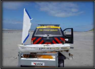
"The Little Boat that Could" launched near Georges Bank in January, landed in Benbecula, Scotland in June!