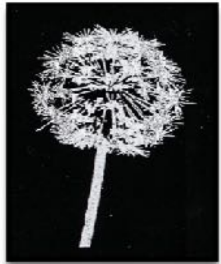
Printed Design in White Opaque Paint

As an active subscriber, you have unlimited access to in-house Photoshop conversions and discounted Thermofax screens for a full year.