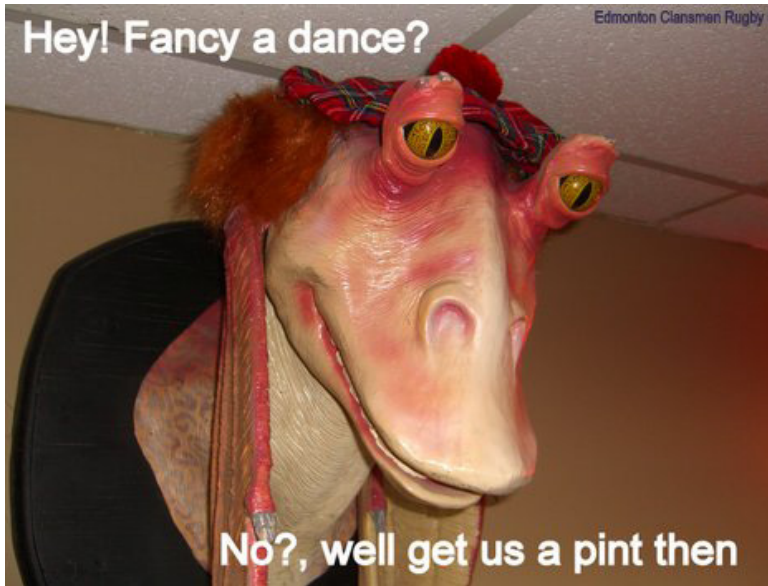
The Club had a muskox head for years, until it got smashed during one of the restorations. It has since been replaced by Jar Jar McBiggs.