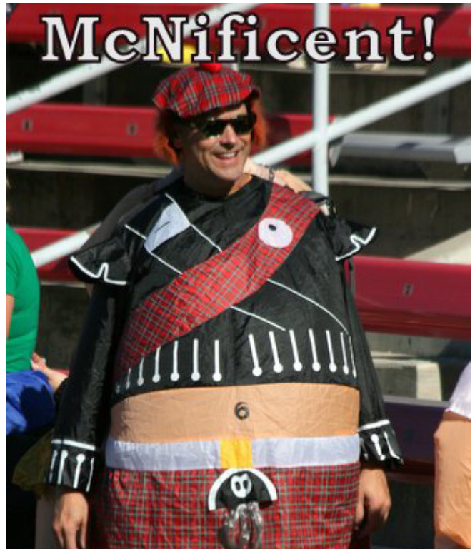
Many Clan members and alumni will be in Vancouver this March for the Rugby Sevens? Why not you?