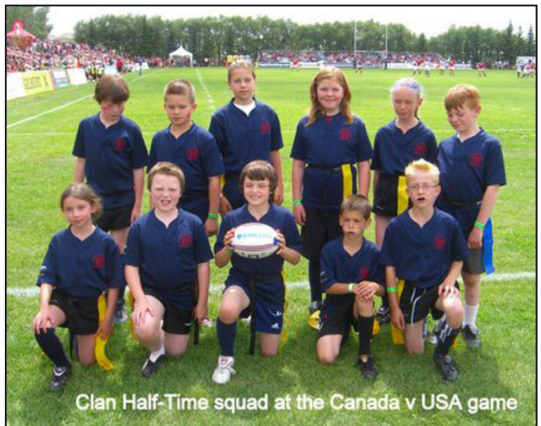
Clan Half-Time squad at the Canada v USA game