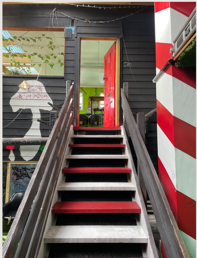
Stairs to main smokers