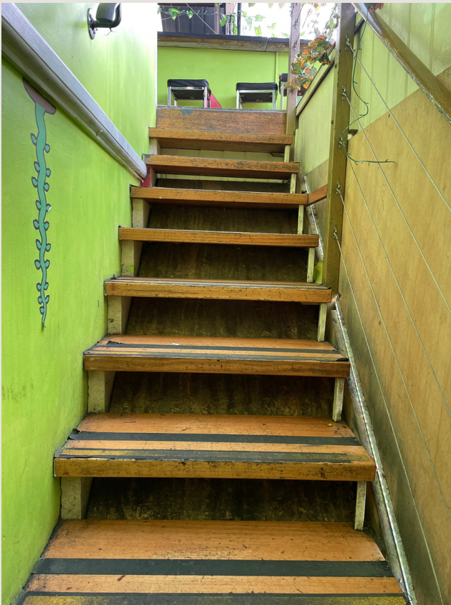
Staircase to main smokers

Second Flight (10 steps) - 290mm x 180mm x 650mm (D x H x W)