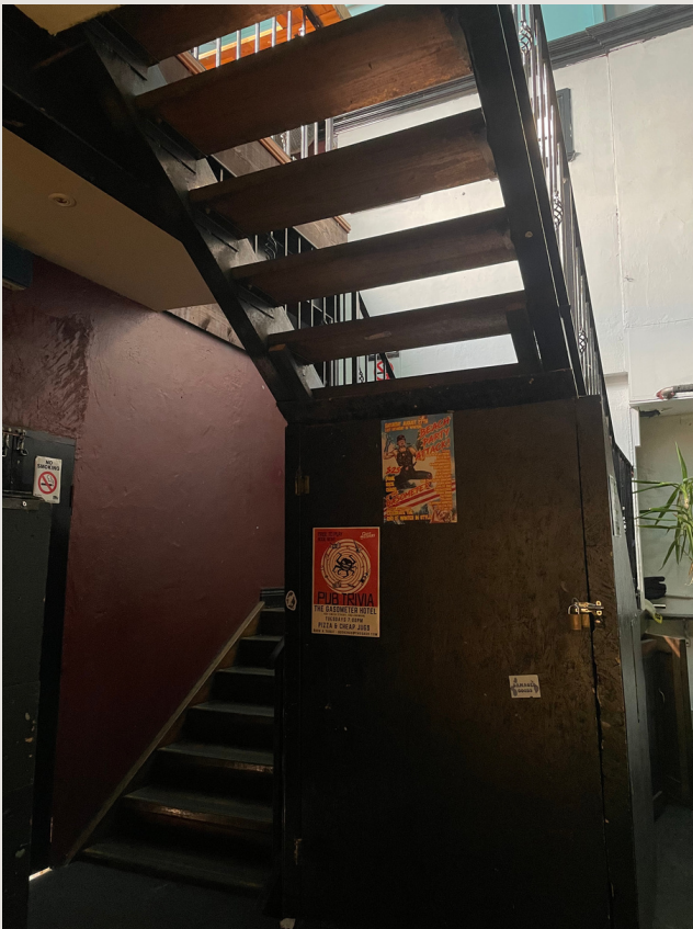
Staircase entrance from dance floor

Second Flight (11 Steps) - 300mm x 170mm (D x H)