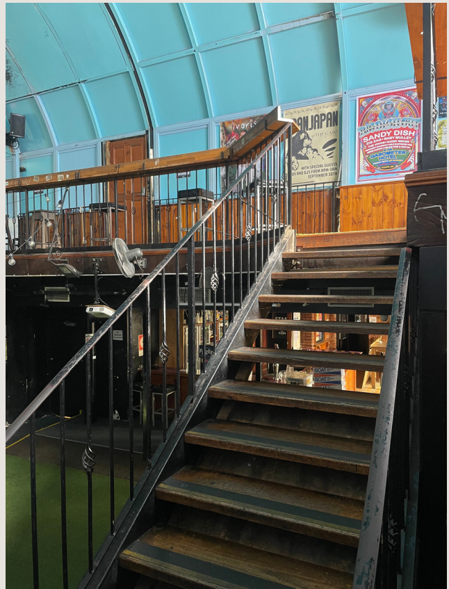
Second flight from landing