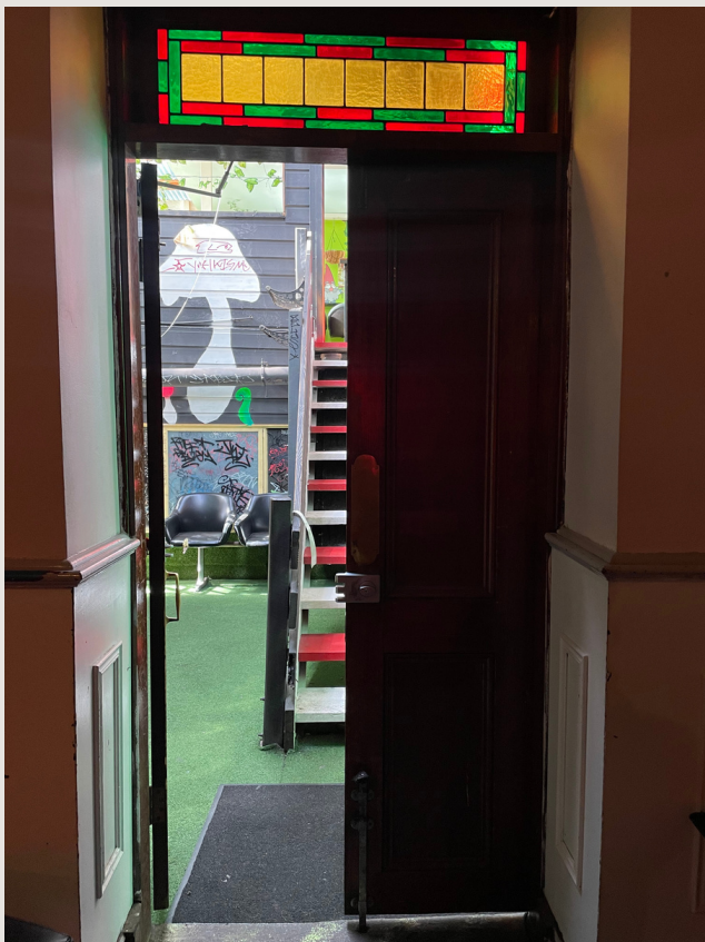
Door to upstairs smokers

Main Smokers Doorway - 800mm 2000mm (W x H)