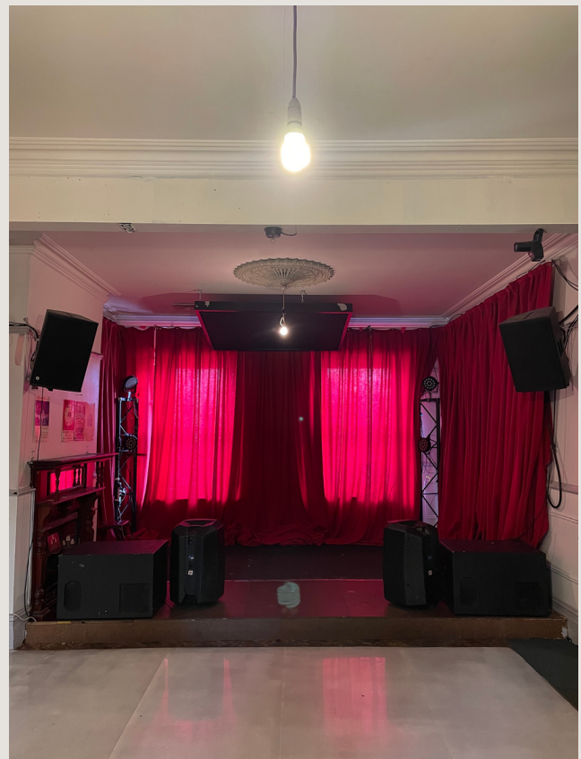
Upstairs bandroom stage