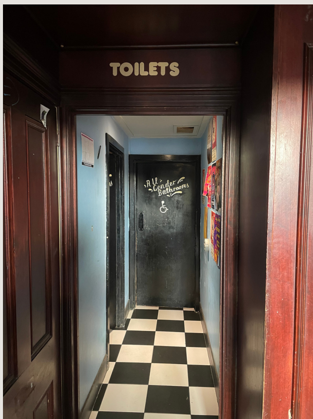
Toilet entrance alongside bar

Disabled Toilet - 1800mm x 1800m (L x W)