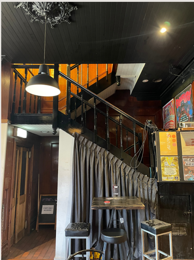
Staircase to upstairs bandroom

Third Flight (8 steps) - 280mm x 170mm x 750mm (D x H x W)