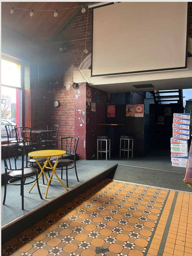
Bar looking towards dance floor