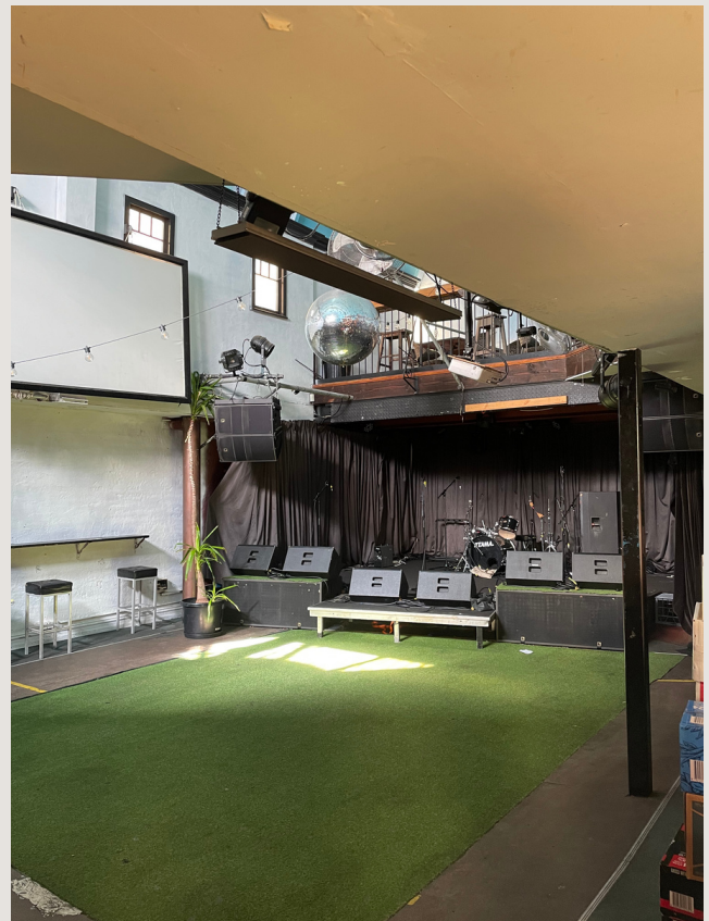
Dance floor and stage