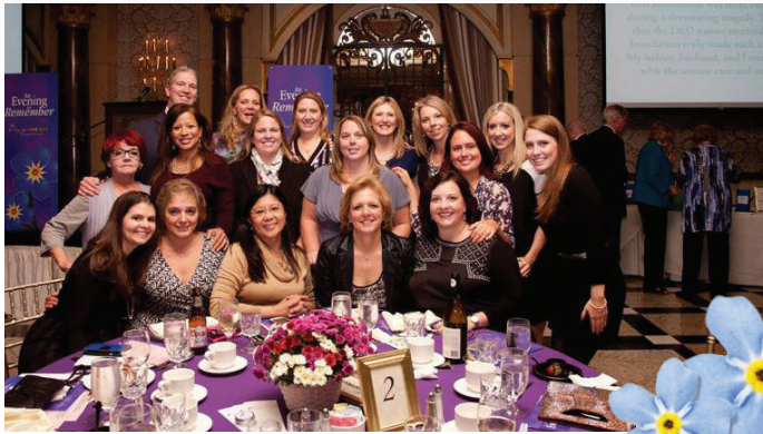
Members of the HackensackUMC NICU department.