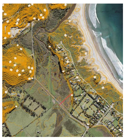
Aerial map of Oruawharo wetland showing contours and approximate location of transect line (red).

A key focus of our restoration effort in Oruawharo Bay is on the DoC managed areas of 'The Medlands Wildlife Management Reserve' at the northern end of the bay behind the Medlands settlement, and the estuary and margins of Waitematuku stream at the southern end. Although this area best fits the wetland categorisation of swamp there is also a strong intertidal element more characteristic of estuaries.