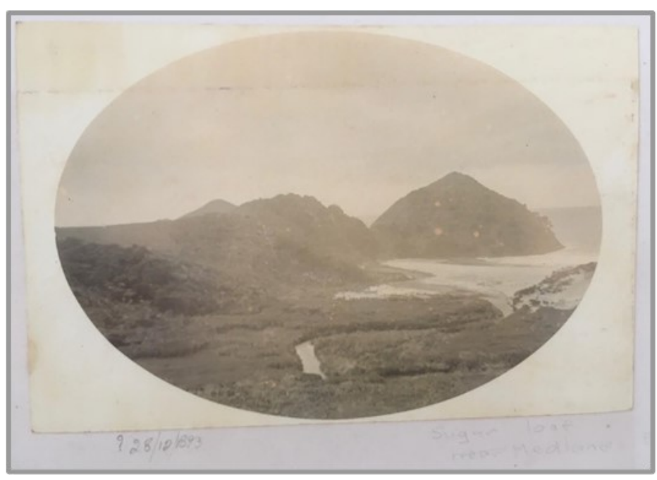
Oruawharo Bay by Henry Winkelmann ca.1892.

1300s. Remnants of vegetable gardens associated with early Māori settlements have been found in the bay<sup>1</sup>. Installation of drains were part of these original farming developments. With the arrival of European farmers on the island, more drainage was installed to improve the land for grazing livestock. In a photo of the wetland area looking toward Sugar Loaf, taken by Henry Winkelmann ca. 1892, it is evident that the natural course of the Oruawharo/ Waitematuku stream is rather different from what we see today, where the creek has been redirected south to make way for more usable land for farming and development<sup>2</sup>.