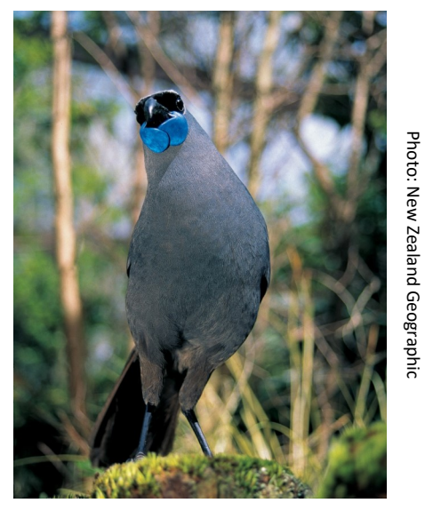
New Zealand north island kōkako.

overseas that we can learn from such as the Clouds of seabirds around every island, a dawn chorus like no other natural symphony every morning, kōkako back in Te Paparahi, everything as it should be on an island where people live, work and play. Done by island people and in a way that enables people to come home, live a good life and know they are hugely valued and appreciated for what they do and that they feel this way about their work and themselves. Barriers are that we need technology and research to develop to a point where we can confidently do this work without the use of vertebrate pesticides, and we have compliance systems in place to ensure when we remove feral cats and rats that we can stop them from coming back.