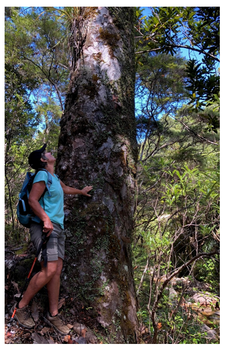
Mature healthy kauri in Wairahi stream Withevs track. Aotea.

Aotea Great Barrier has a long association with kauri dieback and the sad reality is that this disease is likely to remain a threat, both on the island and elsewhere, for some time. We need to get used to the idea that addressing this problem is likely to require a long-term commitment. Ultimately, the future of the kauri forest depends on everybody doing what is best for kauri.