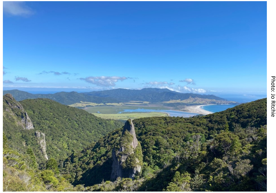
Te Paparahi from Windy Canyon.

While we will utilise a lot of high tech to achieve the objectives of TMT, it is important that we don't over complicate how we do this. I liken it to the use of the computer. The users don't necessarily need to understand the technical details of the hardware and software on their computer but just how to use it effectively. We need people on the ground with devices tapping into powerful remotelycontrolled systems. Making sure we have devices and systems that work in remote places will be very important.