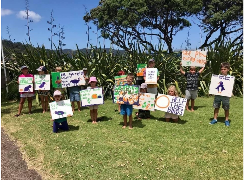
Children from Kaitoke school with their bird protection signs.

A missed opportunity was the absence of a experience behind me. The high was the fan- island before the eradication. The DOC team