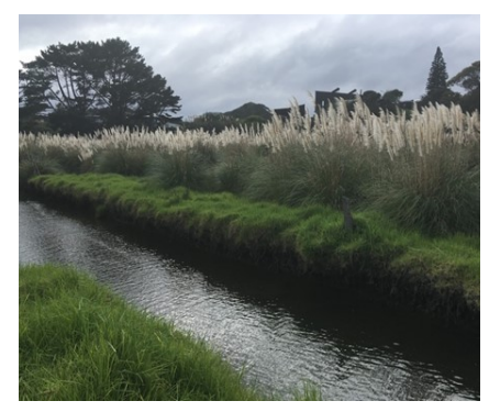
Wall of Pampas grass along a waterway in the wetland.

Along with the drainage and development of this bay for farming, came the introduction of many exotic plant species. These included the highly invasive kikuyu (Pennisetum clandestinum) and Pampas grass (Cortaderia selloana) which were introduced to the island in the 60's to provide additional forage for grazing animals. Both have since spread all over the island,