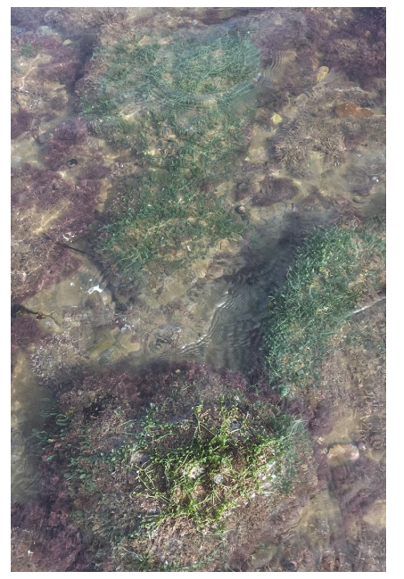
Non-native Caulerpa brachypus on edge of Blind Bay Harbour.

the Department of Conservation responded to Further surveillance in September showed an the incursion. Exotic Caulerpa species was also present in