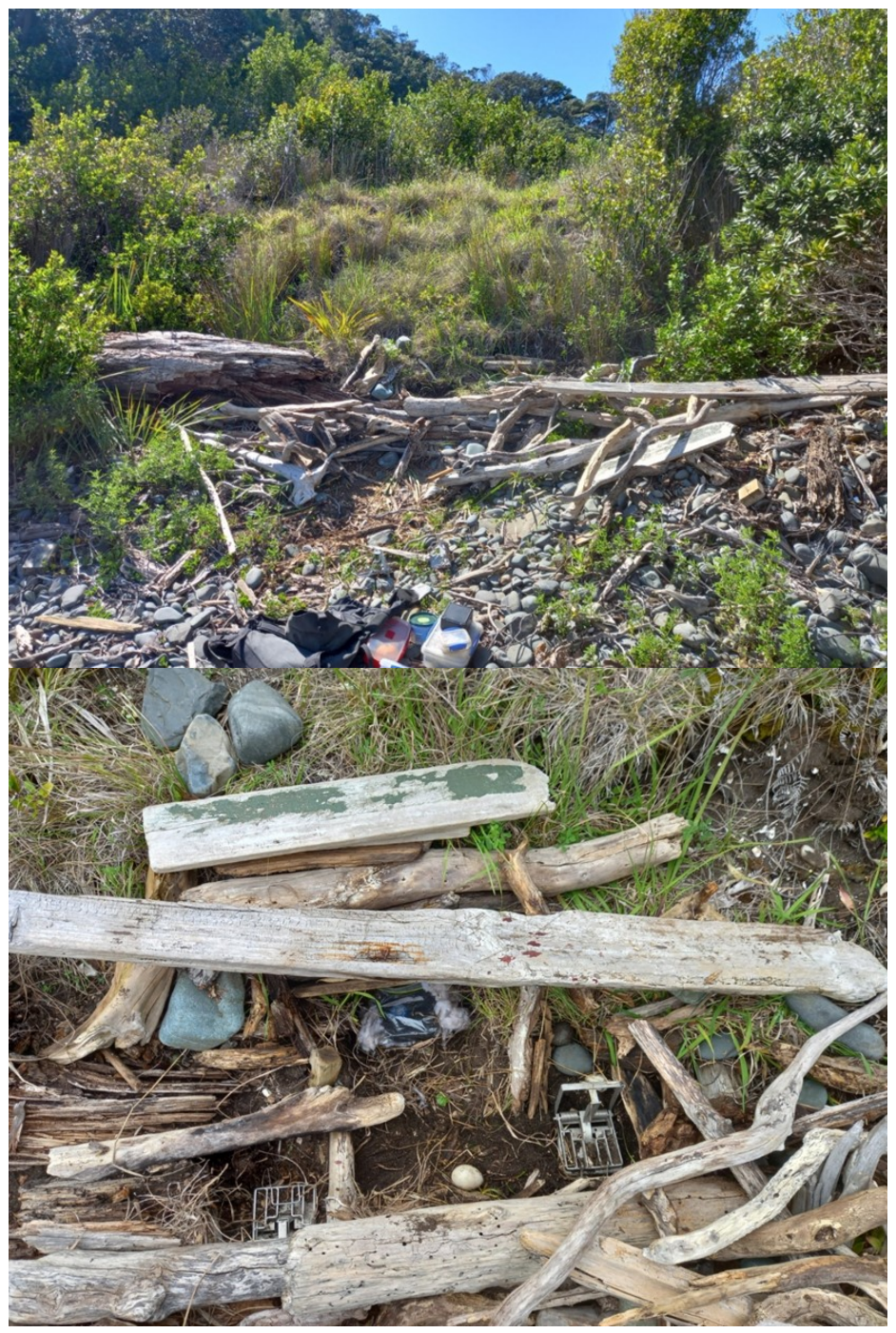
Site for reconstructed natal den site on Motutapu Island isthmus beach (2A) comprising two DOC200 traps in tunnel with infertile penguin egg in central chamber with 'sonic' lure.