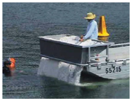
Salt trials in Lake Macquarie, NSW to control C. taxifolia.

The salt will affect some local marine species in the small areas that are treated, but they are likely to recolonise the treated area within months. Where possible, some species such as scallops were removed from the treatment area before the salt was applied. This method may not be a viable treatment for the widespread infestation in Blind Bay, so alternative methods may need to be explored.