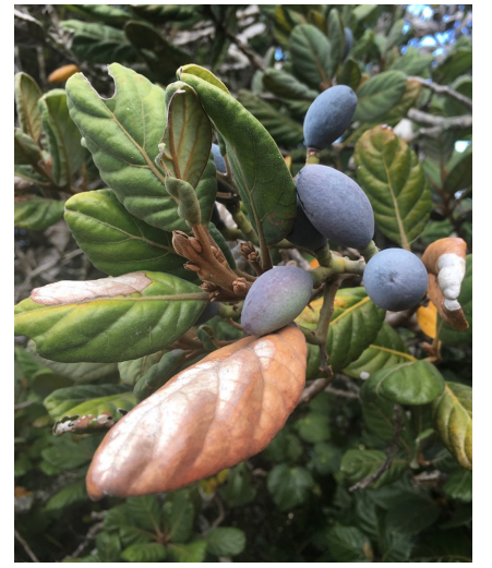
Taraire in fruit on Aotea Great Barrier.

Gone are the days when flocks of 30 birds rose and swooped in the valleys of Tryphena, Awana, Okiwi or Motairehe. You might see a flock at Windy Hill if you're lucky, but otherwise a single kererū at roost, a pair of kererū feeding during on kōwhai winter (they are monogamous), or perhaps a male engaged in his elegant dives and swoops near the nest, are what we think of as "normal". It most definitely is not, and the fact that kererū were a major increase.