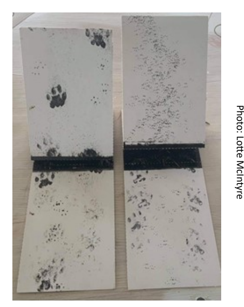
Monitoring card showing cat, rat and mice paw prints.

In 2020, OME successfully applied for funding from the Department of Conservation for a three-year project to begin restoration of the DoC-managed wetland. The first steps to this restoration work include reducing introduced pest species, plant as well as animal, and encouraging the natural regeneration of plants in