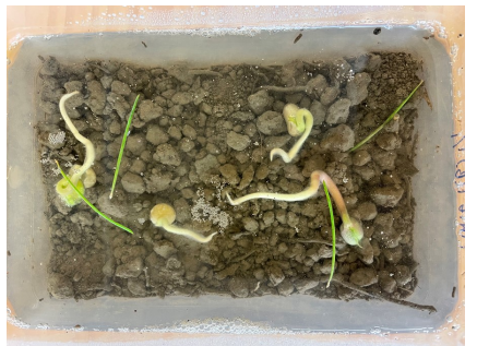
Testing for presence of P. agathidicida in soil by using lupin sprouts as bait to attract the motile zoospores.

stimulates the production of motile zoospores by P. agathidicida. After moist incubation the samples are flooded with water and plant tissue "baits", often with cedar needles or lupin sprouts added. The samples are then left for two or three days to allow the zoospores of P. agathidicida and potentially those of other species to colonise the baits. From this point fairly standard microbiological approaches are used to isolate and establish cultures of the organisms that colonised the baits. Identifying isolates of P. agathidicida from amongst those recovered for a given sample relies primarily on morphology. A trained eye has to assess each isolate, looking for the physical features characteristic of this species. As a final step in this process the identity of isolates may be confirmed using a genetic test.