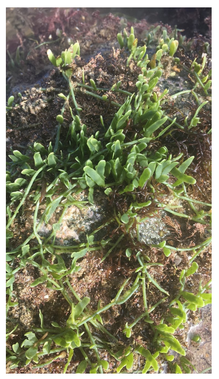
Non-native Caulerpa brachypus on edge of Blind Bay Harbour.

species of Caulerpa in New Zealand that could be confused with C. brachypus; C. articulata and C. brownie, but their morphology is very different<sup>4</sup>. A close relative, C. taxifolia, listed as a Notifiable Organism under the Biosecurity Act, has been bred for use in the aquarium trade, and has become established as a serious aquatic weed In NSW<sup>5</sup>.