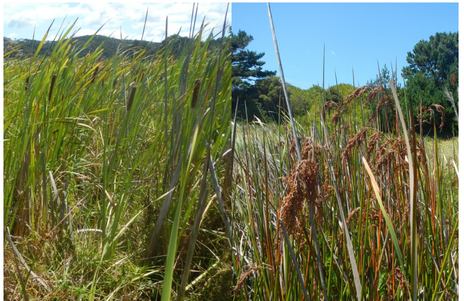
Raupo (Typha orientalis)(left) and jointed twig-rush (Baumea articulata)(right).

Besides the weeds, the other big environmental issue for the wetland, like much of the island, is the high density of mammalian predators, including ship (Rattus rattus) and Polynesian (R. exulans) rats as well as feral cats. To reduce rat numbers to protect both birds and invertebrates in the wetland, OME began trapping in months later revealed that 60% of tracking (transect) through the southern end of 'The have a long way to go to meet a target of 5%,