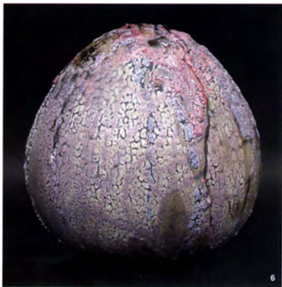
5 Installation in the second room at Edward Cella Art+Architecture, stoneware, concrete, steel, acrylic paint. 2012.

Silverman's Atwater work is fired in oxidation to cone 5–6. He does multiple firings with blister glazes that are high in silicon carbide using a dark clay body such as Laguna's B3. When glaz-