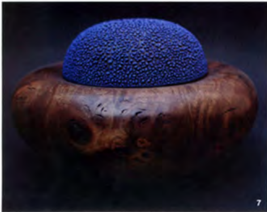
7 Taking Turns , collaborative work with Alma Allen, 8 in. (20 cm) in diameter, iron wood and stoneware, 2011.