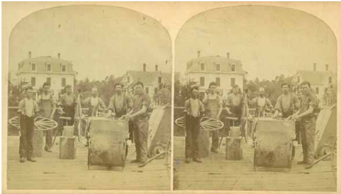
Workers at the George Osgood Carriage Company, ca. 1880.