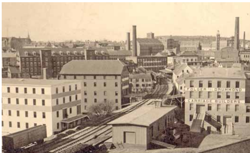
Carrriage-making industries in the lower millyard, ca. 1890.