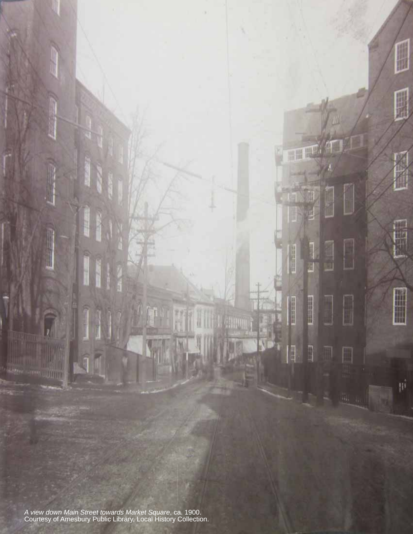
A view down Main Street towards Market Square, ca. 1900.