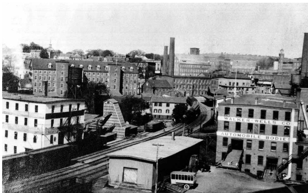
Automobile body-making industries in the lower millyard, ca. 1915.