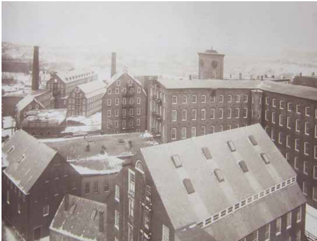
A view from the top floor of Mill 2 (now Amesbury Industrial Supply), looking South, ca. 1900.