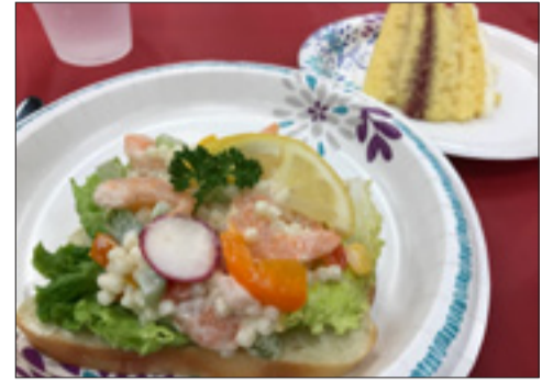
Savor authentic Danish cuisine

Did you know that Tivoli spelled backwards is I love it? Tivoli Fest hashtags: #TivoliFest2019; #ElkHornIowa; #Æbleskiver; #hygge