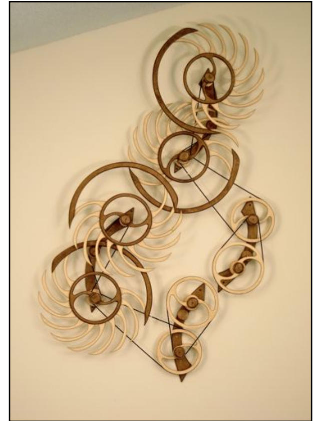
Falling Water II • Directions