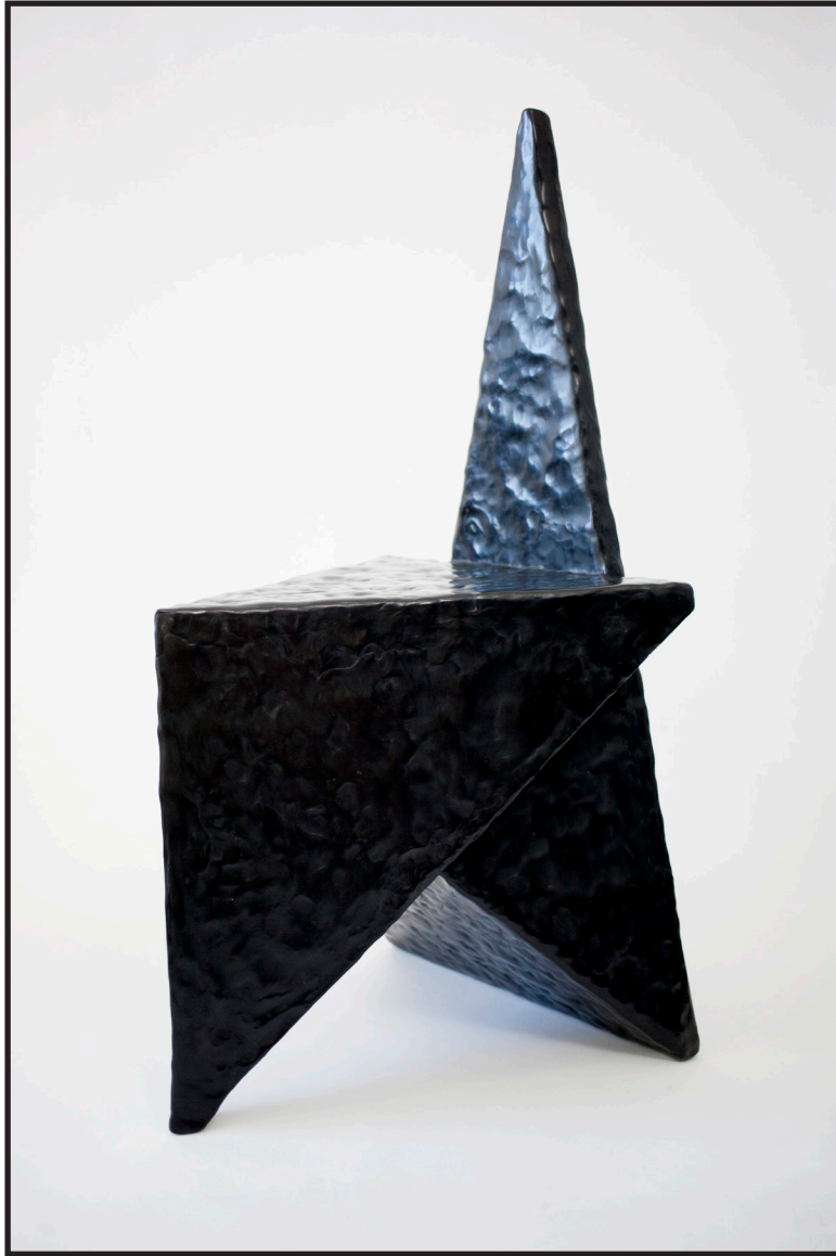
Vanishing Twin Chair, 2016 Shown in black epoxy resin. Measures: 36" H x 17" W x 18" D. Made to order. Lead time 8-12 weeks. Custom finishes and dimensions upon request.

The GEOMETRY IS GOD line is driven by a fascination with Pagan and Alchemical symbolism and ancient geometries. With this series, we have attempted to reinterpret these markings without losing the potency of their primary aesthetic. The goal is to make furniture that is symbolically dense, and as a result the collection could be described as functional sculpture.