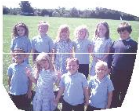
Pictured above is the winning team from the Key Stage 1 Sports event