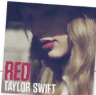
RED TAYLOR SWIFT

Jay Leno told me "It's easy. Just marry your conscience. Marry the one who makes you want to be a better person."