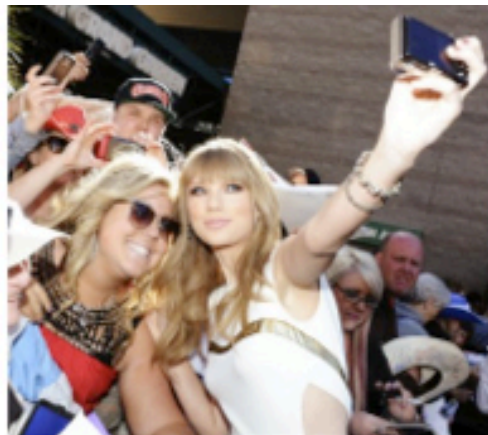
(Top) Taylor is famous for connecting with fans. (Right) Conor Kennedy in Hyannis Port, where he's been photographed hanging with Taylor. (Below) Selena Gomez is one of her BFFs: "We instantly clicked," says Selena of their first meeting. (Bottom) A perfectly choreographed performance...

TAYLOR: "White Horse" is a song that I've always been proud of because it's about that really horrible feeling of a one-sided relationship that isn't balanced; it's one-sided. You clearly love him more than he loves you, and you know it. And it's a sinking feeling, but it's also a really intoxicating feeling. And a lot of times girls will end up in these relationships where he's not giving you anything so you'll take the crumbs. In my mind, what hurts the most is what they [the guy] didn't say. It's when they knew I needed to hear something and they wouldn't