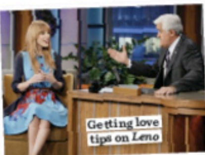
Getting love tips on Leno

Cats. She's the only one who understands me. and she's so funny- looking.