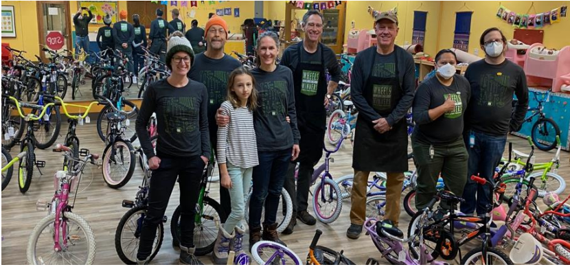
Wheels' volunteers turn out in force to distribute 72 bikes at Centro Hispano

Serving Madison and Dane County since 1992, Wheels for Winners is a 501(c)(3) non-profit that supports bicycling through an earn-a-bike program and related activities. Working with community organizations and schools, we provide refurbished bicycles to youth and adults who perform community service to earn their bikes. Our all-volunteer organization believes that equitable access to a bicycle is an important component of a