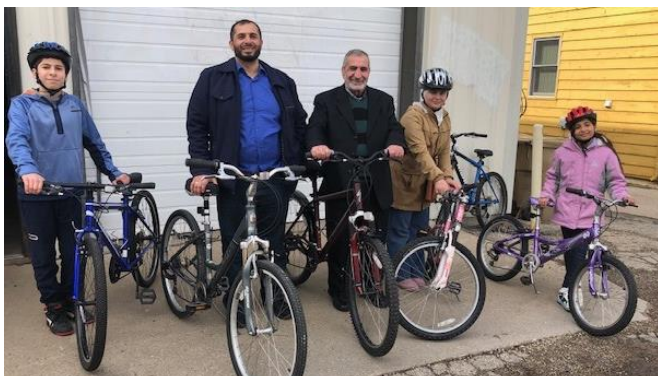
Open Doors for Refugees brought us three generations from a Syrian family to get bikes from Wheels

As is true of many others in this country who witnessed our worldwide refugee crisis, Madison area groups have opened their arms to resettle Ukrainians, Afghans, Syrians, Ethiopian and others displaced by war and other calamities. This year Wheels for Winners worked with Open Doors for Refugees , Jewish Social Services Refugee and Immigration Services , Stoughton Resettlement Project , and the International Crane Foundation to provide 60 bikes to help in these resettlement efforts.