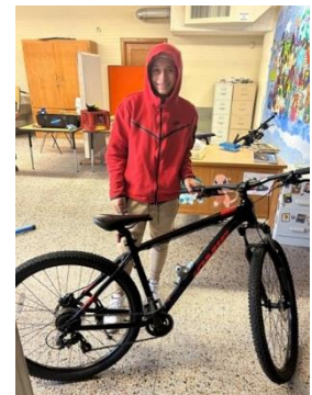
An O’Keeffe student with his completed bike

programming based on their strengths. Wheels for Winners is teaching mechanic skills to interested students to help foster: attention/focus, problem solving, fine motor skills, following instructions, and communication skills. Students are working on their own bikes as well as offering free repair services to students and staff.