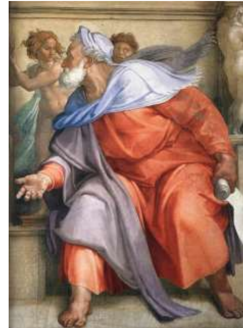
The Prophet Ezekiel, 1510. by Michelangelo Buonarroti, Sistine Chapel, Vatican City, Rome, Italy.

Spread, O spread, thou mighty word, spread the kingdom of the Lord, that to earth's remotest bound all may heed the joyful sound.