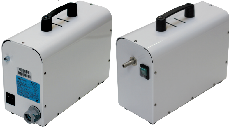
Figure 1 – MINISCAV™ and Accessories

This device is intended for professional use only in healthcare facilities, clinics, and physician and dentist offices.