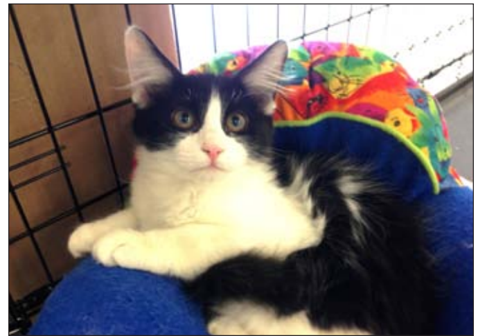
A 4 month old female, Pepper is available for adoption.