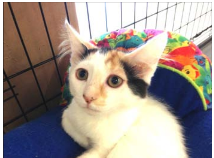
Another 4 month old female, Caliie is ready for her new home.