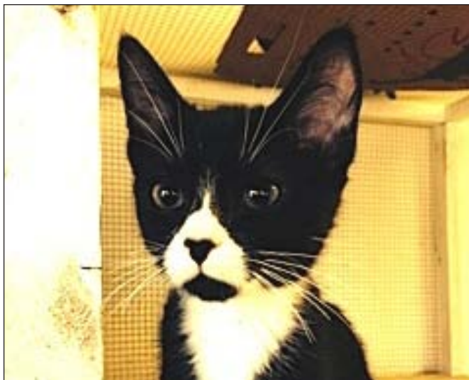
Tree Climber, one of our newest rescues, waits for breakfast at Barb's place. Feeder Judy found this little kitty crying up a tree.