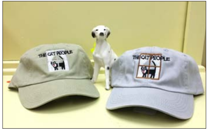
These handsome Cat People logo caps are going fast! Get yours today at our Gift Shop.