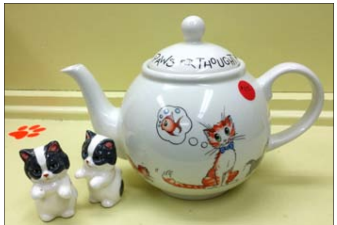
This lovely cat-themed teapot would make a fine addition to your collection of feline knick knacks.