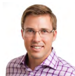
RJ Milnor Chevron