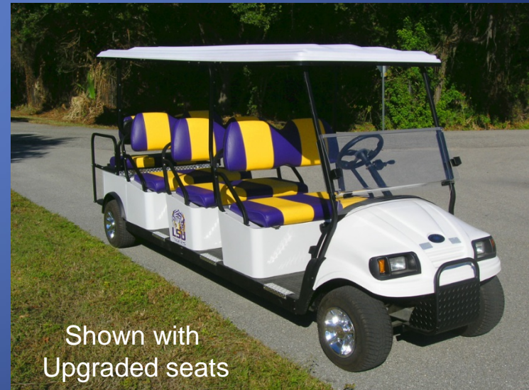
Shown with Upgraded seats