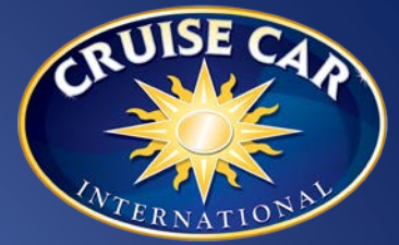
Cruise Car, Inc. World Headquarters Sarasota Florida, USA