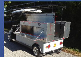
Custom Tool Box