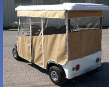
Sunbrella Roll down Enclosure