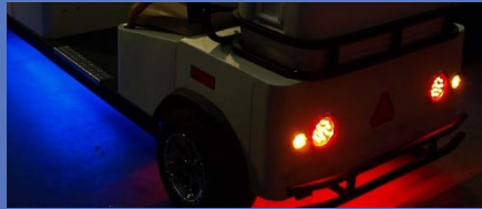
LED Lights – within or beneath