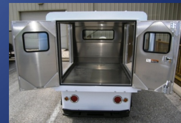
Custom Shelving Available