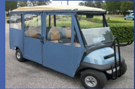
Sunbrella with Magnetic Doors