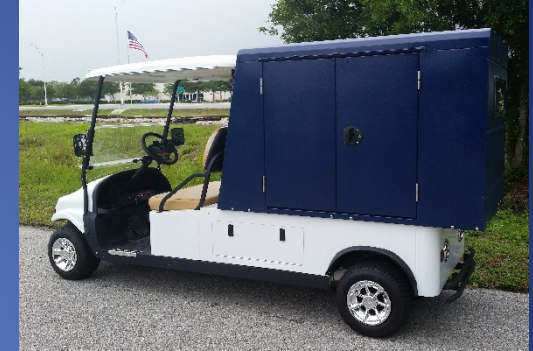
Cargo Van with Hard Doors