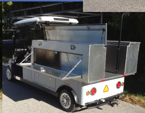
Reading Truck with work bench and Ladder Rack