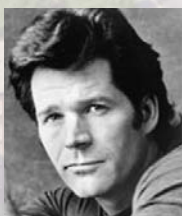
Andre Dubus III