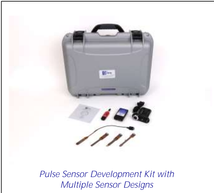
Pulse Sensor Development Kit with Multiple Sensor Designs