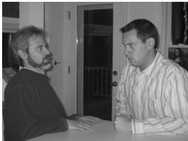
Fig. 1. The priming stimulus. Participants in the fear- and anger-prime conditions viewed this stimulus and told a story about either the fearful (in the fear-prime condition) or the angry (in the anger-prime condition) character. Participants in the neutral-prime condition saw a cropped, less emotional version of this stimulus and told a story about a neutral conversation the two characters were having.

unpleasant affect, pleasant affect, high-arousal affect, and low-arousal affect (the raters discussed any discrepancies between judgments until 100% reliability was achieved). This coding procedure allowed us to assess the full range of emotional (fear, anger) and affective (unpleasant, pleasant, high arousal, and low arousal) content produced by participants during the priming manipulation and allowed us to verify that our priming procedure was, in fact, effective.