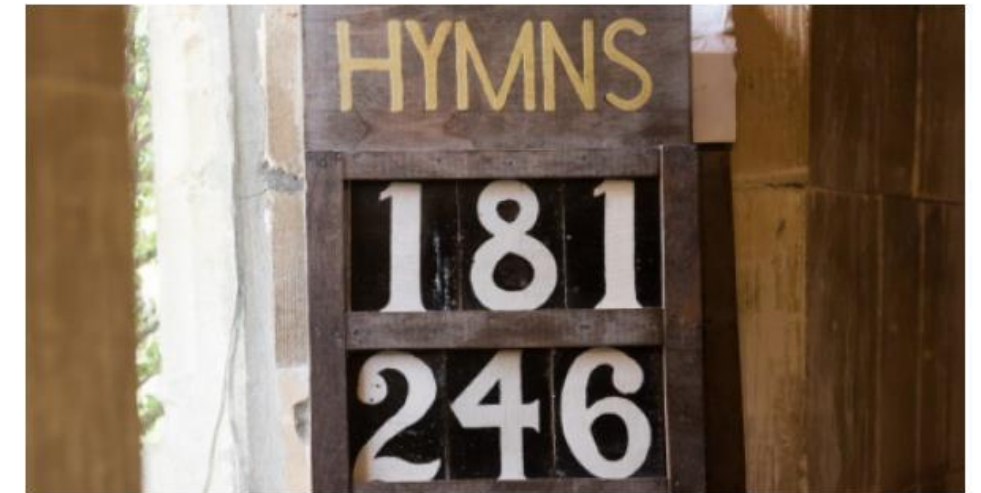
New Hymnal Dedication "Celebrating Grace" March 11