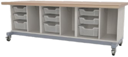
2 - 3 STUDENT DESK