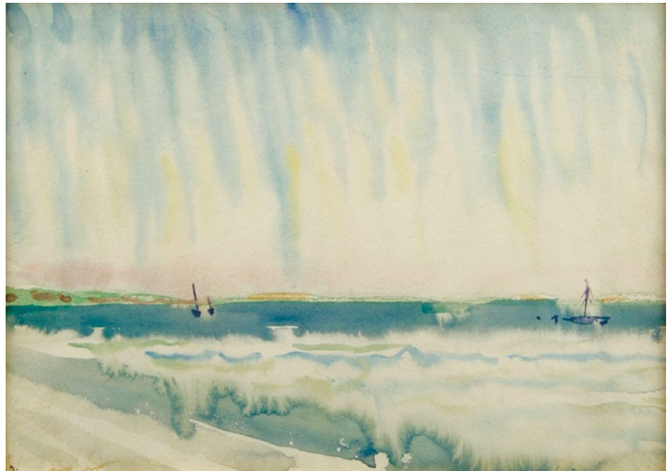
Charles Demuth (1883–1935), Seascape , ca. 1915. Watercolor on paper, 9¼ x 13¼ in.