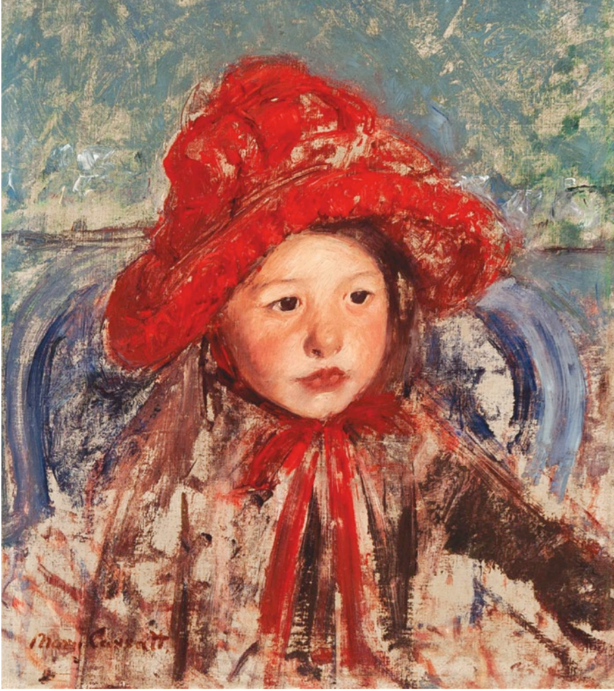
Mary Cassatt (1844–1926), Little Girl in a Large Red Hat, ca. 1881. Oil on canvas, 17¼ x 15¼ in., signed lower left: 'Mary Cassatt'.