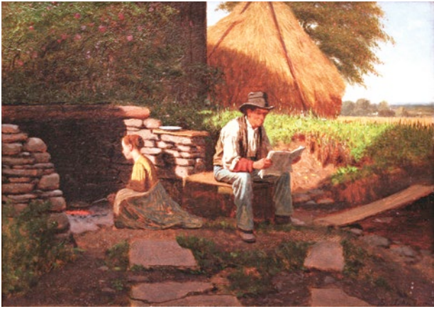
Eastman Johnson (1824-1939), Catching Up on the News (Reading the News). Oil on board, 10 x 13¼ in., signed lower right: 'E Johnson'.