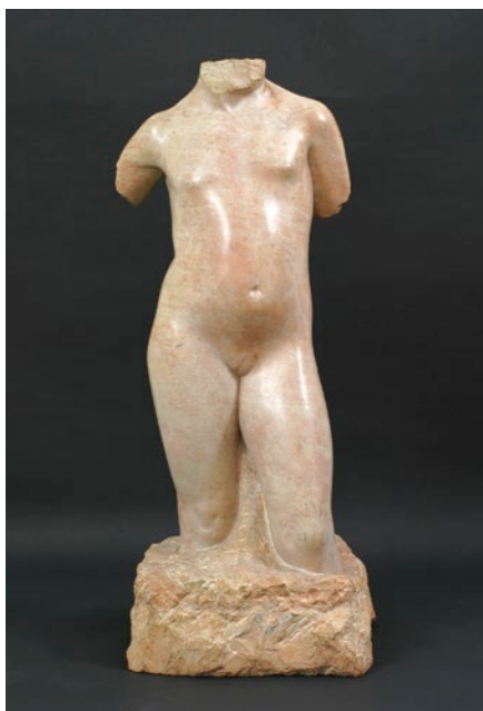
Jo Davidson (1883–1952), Torso of a Young Girl, 1932. Burgundy limestone, 36½ x 14 x 13 in., signed base, left side: 'Jo Davidson/1932'.