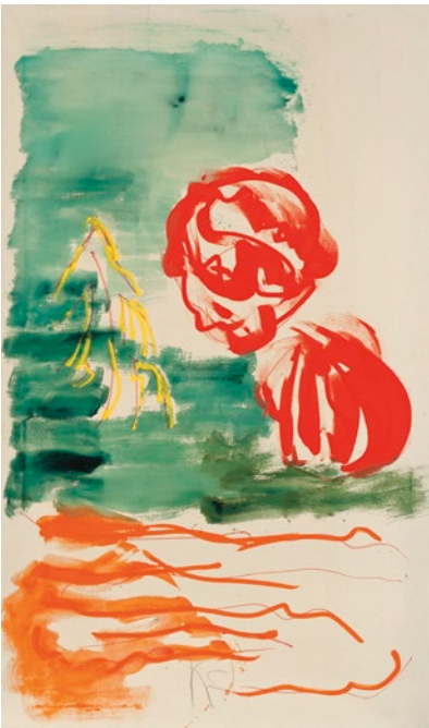
Kimber Smith (1922–1981), 2 Roses & Yellow Tulip , 1980. Acrylic on canvas, 60 x 36 in., signed bottom center: 'KS'; signed verso: 'KS 1980'; inscribed: '5 FEET x 3, 2 Roses & Yellow Tulip'.

Galleries on the roster give art fans a diverse set of styles to look forward to. Offerings include paintings from the American art inventory at GRAHAM, as well as a sculpture exhibition by American and European figurative and animal sculptors of the 19 th and 20 th century. Menconi + Schoelkopf Fine Art displays 19 th - and early-20 th -century paintings by American impressionism, the