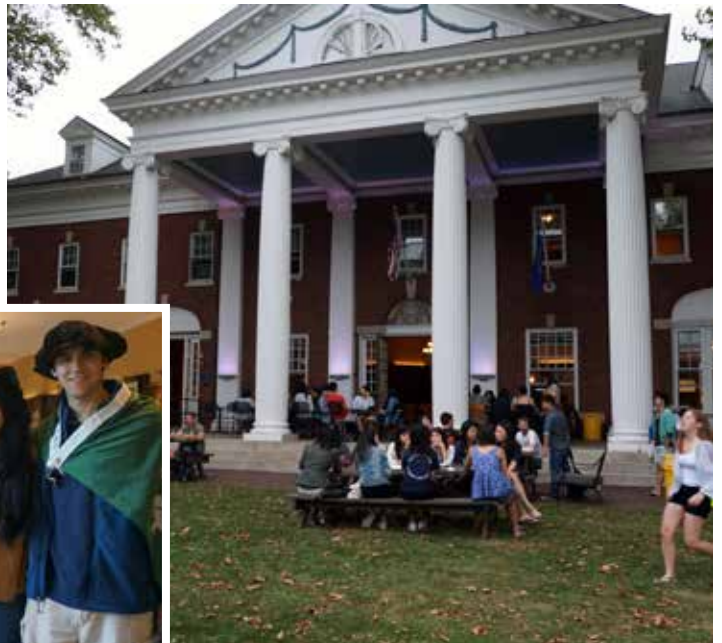
Bound together by genuine ties of friendship