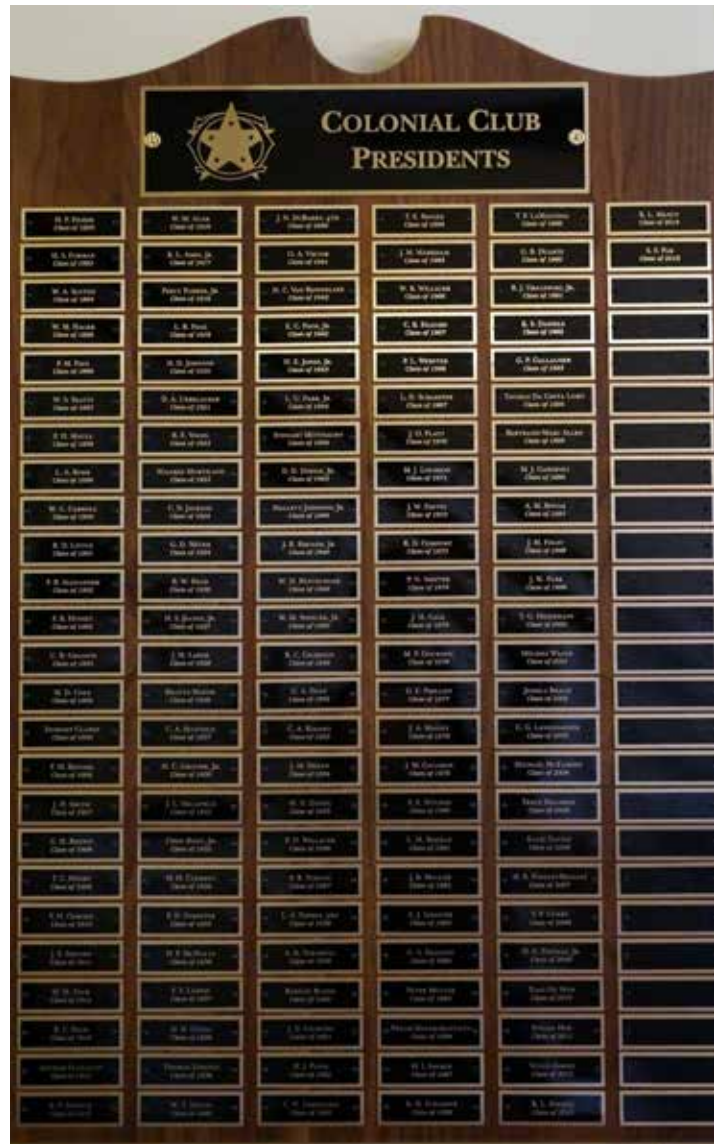
As part of the on-going Colonial history project, the President's Plaque, showing the names of every Club President since its founding, is now on display, showing the spirit of Colonial's proud history and tradition.