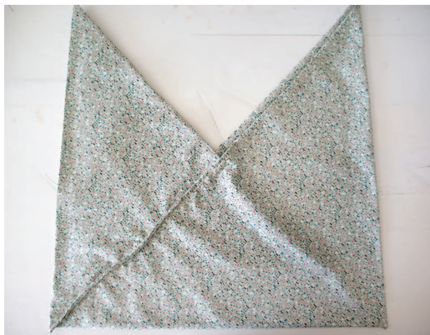
Stitch front and back with a \frac{1}{4} " seam allowance. Straighten bag and press to crease side and bottom edges.

4. Open corner so the side creases align. Press to form a point. Measure 2\frac{1}{2} " in from the seam line and mark a line perpendicular to the crease line. Stitch on the line; do not trim the corner. Repeat for the other side. Turn right side out.