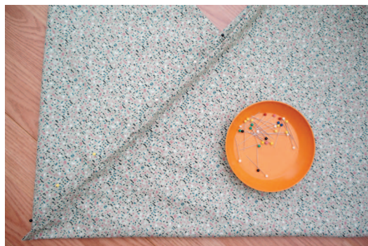
Pin edges together

Straighten edges on front and back so all touching edges are parallel and perpendicular to each other. Pin the parallel edges on the front and back. Stitch with a \frac{1}{4} " seam allowance. Straighten seams and press. Leave wrong side out.