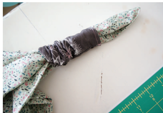
Stitch to join handles

Slip the tube over one handle with seam toward bag opening. Overlap the ends of the 2 handles about \frac{1}{2} " and stitch through all layers several times to secure. Slid the tube in place over the joined handles.