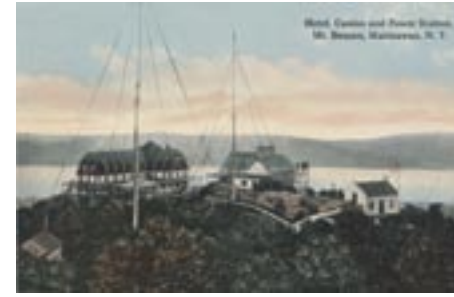
Beaconcrest Hotel, "Casino" and Incline Railway Wheel House