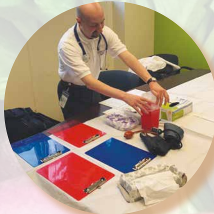
COLUMBUS PUBLIC HEALTH NURSE