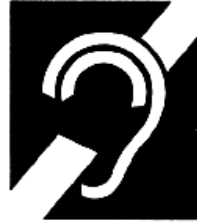
(d) International Symbol of Access for Hearing Loss