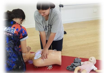
Staff completing their First Aid Training