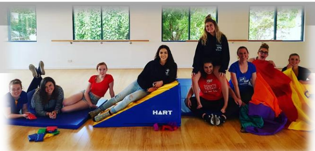
Dance Kingdom Training Day for Tots Instructors

All class selections need to be finalized this week. Please make sure you have enrolled your child/ren into their desired classes. Many classes are now full with a waiting list or nearly full. We will roll this over each term after your initial sign up in Term 1. If you wish to discontinue a class, please send us an email before the start of the next term so we can open the place up to a new student.