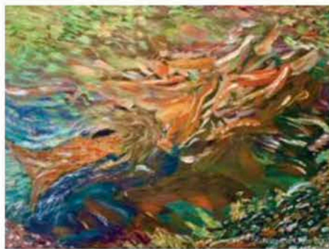
Oil painting by Natasha Chee

working in various mediums including painting, photography, ceramics, and knitting, as a way of expressing my creativity. These activities allow my brain to enter a state of flow whereby I completely immerse myself in my art. I often flip the canvas painting multi-directionally, using brushes and palette knives to create texture and evoke emotions in the resultant artwork. I utilize photography as a way of transforming a moment into a dream-like state of abstractionism, whereas knitting and ceramics are more meditative, tactile, and organic methods of creating something beautiful. My inspirations come from anything experienced in the world, whether it be a memory, a dream, a film, a song, an artist that I admire, or an abstract idea. I was fortunate to be raised in an artistic family where art was discussed, valued, and celebrated as a way of life.