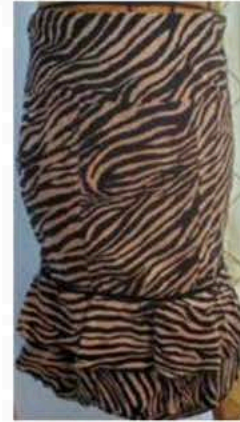
Skirt and blouse designed by Qiana Washington