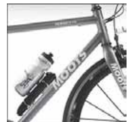
The preferred mounting location is on the down tube of a bike as shown above

Attach a water bottle cage using the supplied screws and lock nuts. Screws must extend slightly past the tightened lock nuts (C) in order to fasten the water bottle cage to the Behold cage securely. If they don't, you'll need to use longer screws than the ones supplied. (Please note: screws that come with the Behold are the correct length for King Cage water bottle cages.)