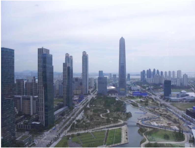
Fig. 1: Songdo, South Korea. (Photo: Orit Halpern, 09/04/2014.)

Smartness has to happen somewhere. However, advocates of smartness generally imply or note explicitly that its space is not that of the national territory. Palmisano’s invocation of a smarter planet, for example, emphasizes the extra-territorial space that smartness requires: precisely because smartness aims in part at ecological salvation, its operations cannot be restricted to the limited laws, territory, or populations of a given national polity. So too designers of “smart homes” imagine a domestic space freed by intelligent networks from the physical constraints of the home, while the fitness app on a smart phone conditions the training of a single user’s body through iterative calculations correlated with thousands or millions of other users spread across multiple continents. 7