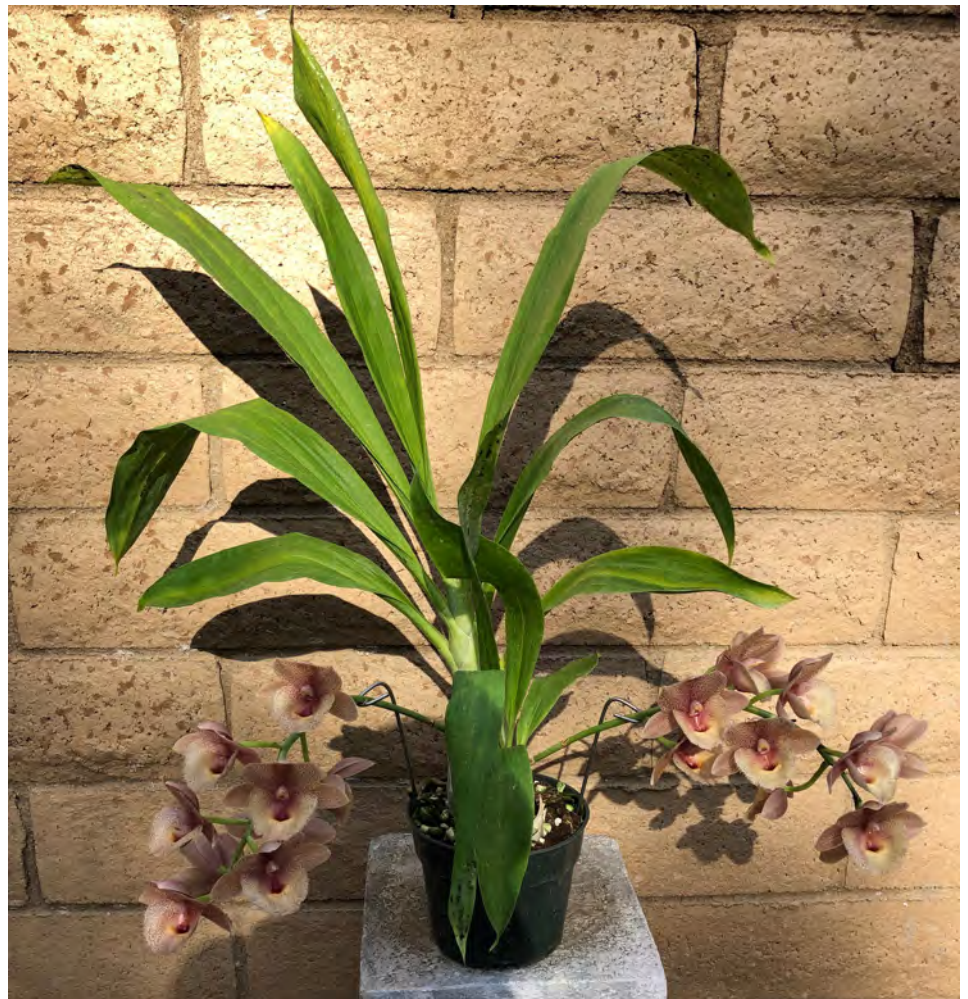
Fdk. After Midnight 'SVO' AM/AOS × Ctsm. Orchidglade 'Davie Ranches' AM/AOS