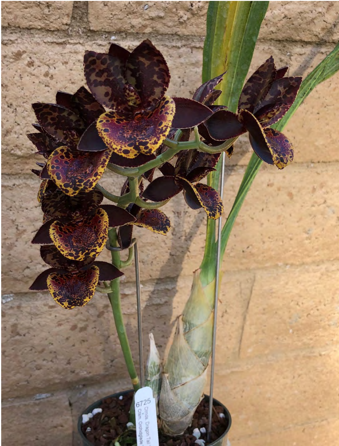
COVER PHOTO: Paph. Faan Kruger 'Golden Stretch' × Paph. sanderianum 'Dark Spider'.