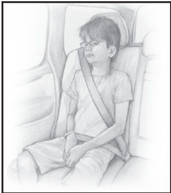
Figure 7: Lap and shoulder seat belt.

Seat belts are made for adults. Your child should stay in a booster seat until adult seat belts fit correctly (usually when the child reaches about 4 feet 9 inches in height and is between 8 and 12 years of age). When children are old enough and large enough to use the vehicle seat belt alone, they should always use Lap and Shoulder Seat Belts for optimal protection.