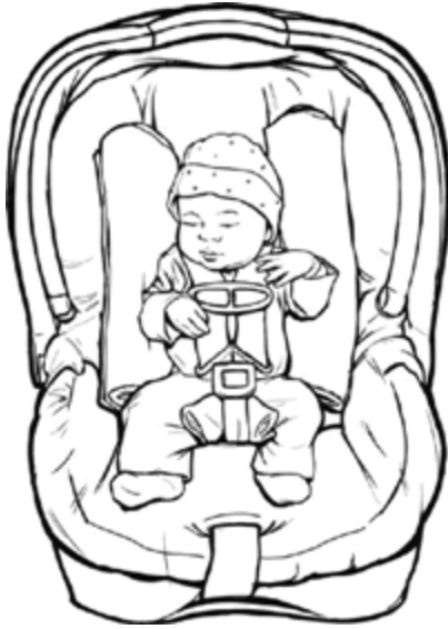
Figure 4: Car seat with a small cloth between crotch strap and infant, retainer clip positioned at the midpoint of the infant's chest, and blanket rolls on both sides of the infant.

A: Blanket rolls may be placed on both sides of the infant and a small diaper or blanket between the crotch strap and the infant. Do not place padding under or behind the infant or use any sort of car seat insert unless it came with the seat or was made by the manufacturer of the seat.