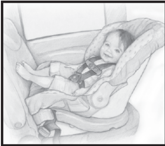
Figure 2: Rear-facing car seat.

When children reach the highest weight or length allowed by the manufacturer of their rear-facing only seat, they should continue to ride rear-facing in a convertible seat or 3-in-1 seat.