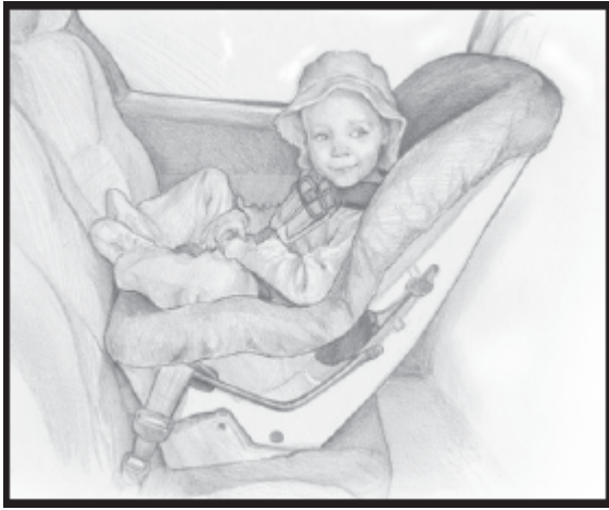
Figure 3: Convertible car seat used rear-facing.