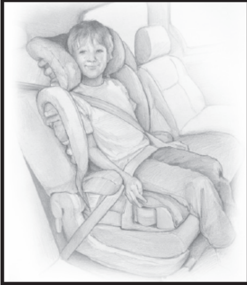
Figure 6: Belt-positioning booster seat