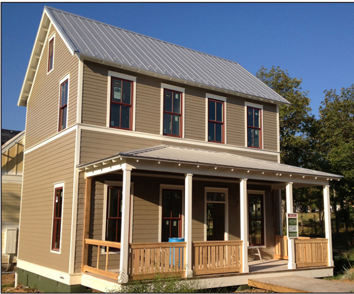
Built w/o Master Extension