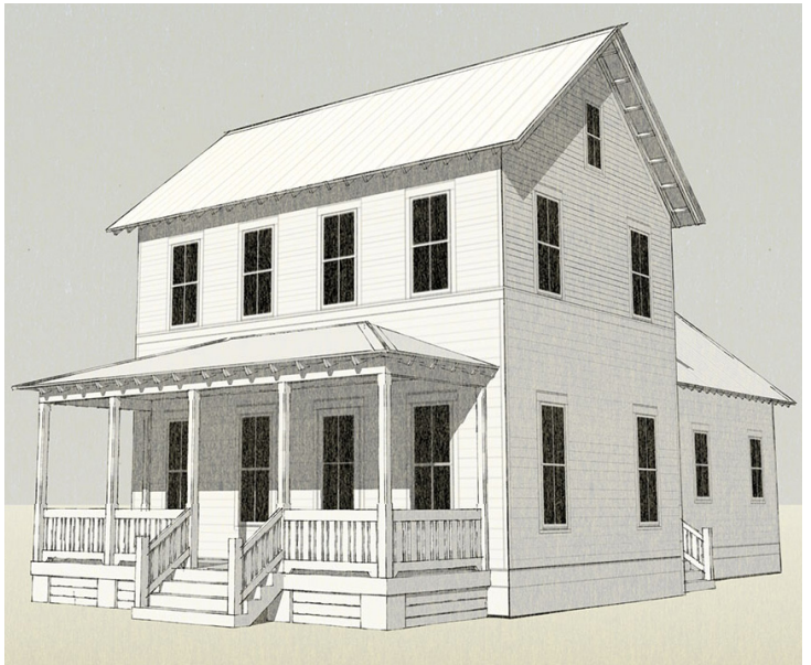
Shown w/ Master Extension