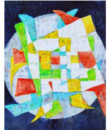
Ode to Pi Day, Truncated, with Errors Inspired by Pi, Watercolor • 20” x 16”

The paintings are comprised of layers of transparent watercolor and watercolor pencil or water-soluble graphite on Multimedia Artboard™, a rigid paper substrate. In some paintings, intense colors and murky darks all but obliterate the underlying text. In others, wispy lines of water-soluble graphite are punctuated with jolts of color. The paintings are driven by content, but content is secondary to the interplay of color and form.