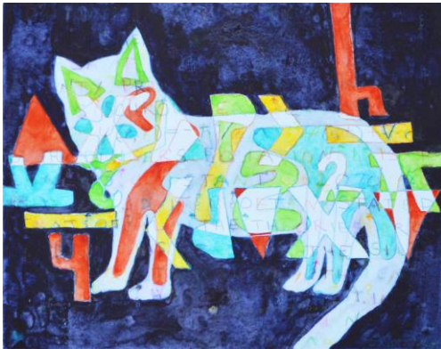
“Hey, Heisenberg, have you seen my cat?” Inspired by Heisenberg Uncertainty Principle Watercolor • 16” x 20”