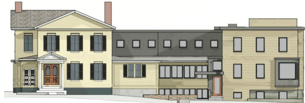
287 College St - Residential