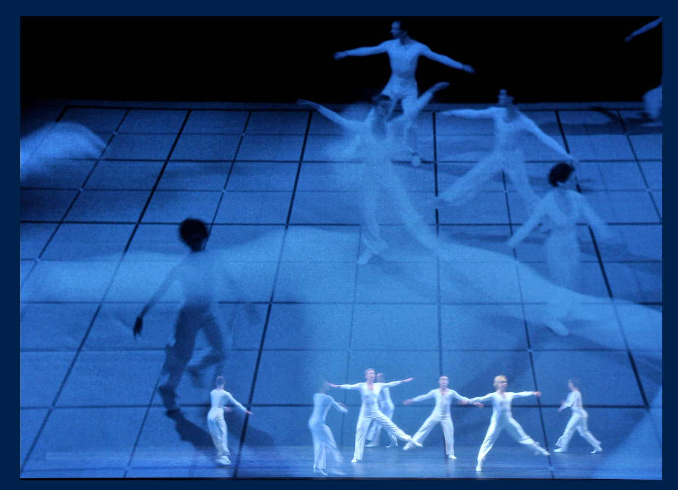
Fig. 1. Dance revival performance. Photo: Sally Cohn, c. 2009.