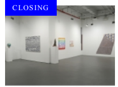
“Looking Back: The 10th White Columns Annual” at White Columns, through Feb. 20 320 West 13th Street