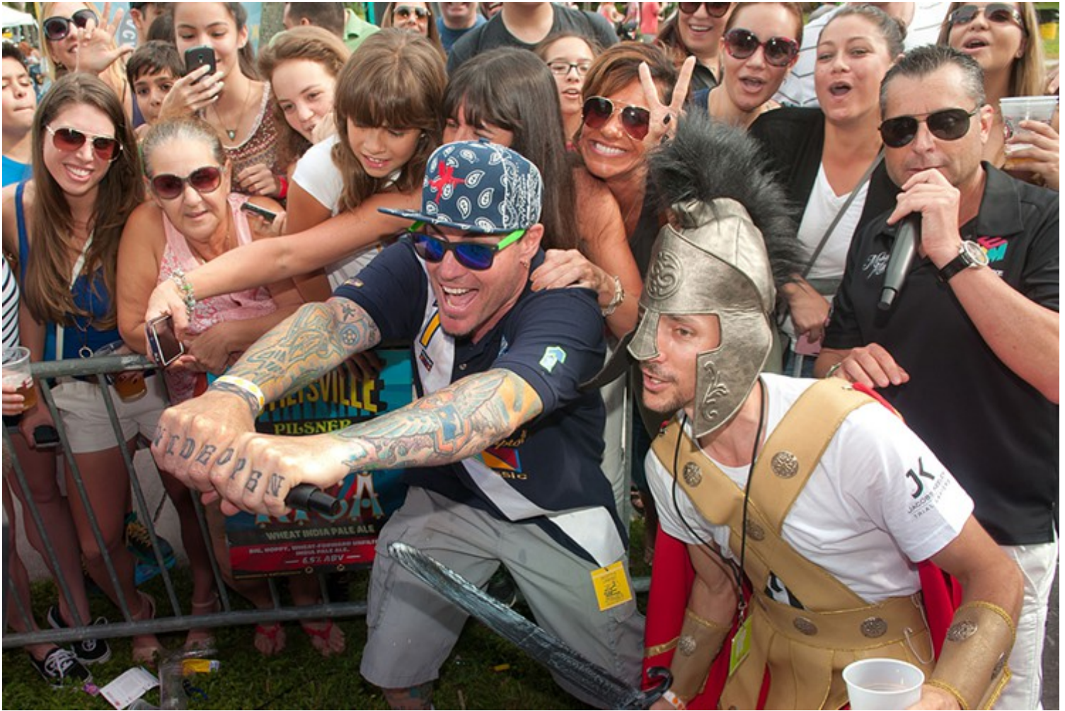
The best way to win the race is on a mattress: See Friday.

WEDNESDAY, OCTOBER 7, 2015 | 7 HOURS AGO