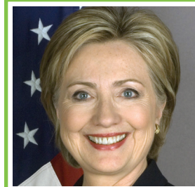
Hillary Clinton Democrat

Positions for all candidates are based on responses to a Minnesota Family Institute questionnaire, recorded votes, media reports and/or public statements. Candidates who were sent a questionnaire but did not respond received follow-up phone calls and e-mails. Documentation for positions based on media reports and/or public statements can be found at www.mfc.org/voter-guide .