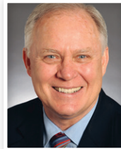
Sen. Dan Hall Senate District 56

Championed the "Ultrasound Bill" to allow women to view their ultrasound prior to an abortion, if an ultrasound is performed. The legislation would require the physician to offer the woman the opportunity to view her ultrasound as it is being done. (2018 SF 2849)(Scored Senate Vote #1)