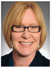
Sen. Michelle Fischbach Senate District 13

Championed legislation to prohibit state funds from being used for abortion. The legislation would conform Minnesota's policy on taxpayer funded abortion with that of the federal government by reinstating a 1978 state ban on the practice of providing free abortions to women on the state's Medicaid program, Medical Assistance. (2017 SF 702)(Scored House Vote #2)