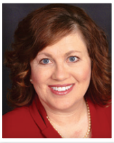
Sen. Michelle Benson Senate District 31

Championed the "Ultrasound Bill" to allow women to view their ultrasound prior to an abortion, if an ultrasound is performed. The legislation would require the physician to offer the woman the opportunity to view her ultrasound as it is being done. (2018 SF 2849)(Scored Senate Vote #1)