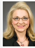
Rep. Cindy Pugh House District 33B

Championed legislation to prohibit state funds from being used for abortion. The legislation would conform Minnesota's policy on taxpayer funded abortion with that of the federal government by reinstating a 1978 state ban on the practice of providing free abortions to women on the state's Medicaid program, Medical Assistance. (2017 HF 809)(Scored House Vote #2)