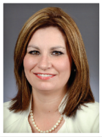
Rep. Mary Franson House District 08B

Championed legislation to prohibit state funds from being used for abortion. The legislation would conform Minnesota's policy on taxpayer funded abortion with that of the federal government by reinstating a 1978 state ban on the practice of providing free abortions to women on the state's Medicaid program, Medical Assistance. (2017 HF 809)(Scored House Vote #2)