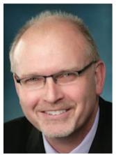
Sen. Roger Chamberlain Senate District 38

Championed the "National Motto Bill" to affirm the ability of public schools to post the national motto, "In God We Trust," reflecting the rich cultural heritage of religion on our society and historic role of religious liberty prominent in our nation's founding. (2018 SF 3061)(Scored Senate Vote #5)