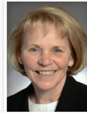
Sen. Mary Kiffmeyer Senate District 30

Championed "Opportunity Scholarship Act" legislation to expand and encourage parental choice in education. The Act would allow individuals and businesses to receive a tax credit for donating to charitable entities that award K-12 scholarships to children from income-qualifying families. The bill expands educational choice by empowering parents to be able to choose the best school for their kids. (2017 Senate Journal p. 3074)(Scored Senate Vote #4)