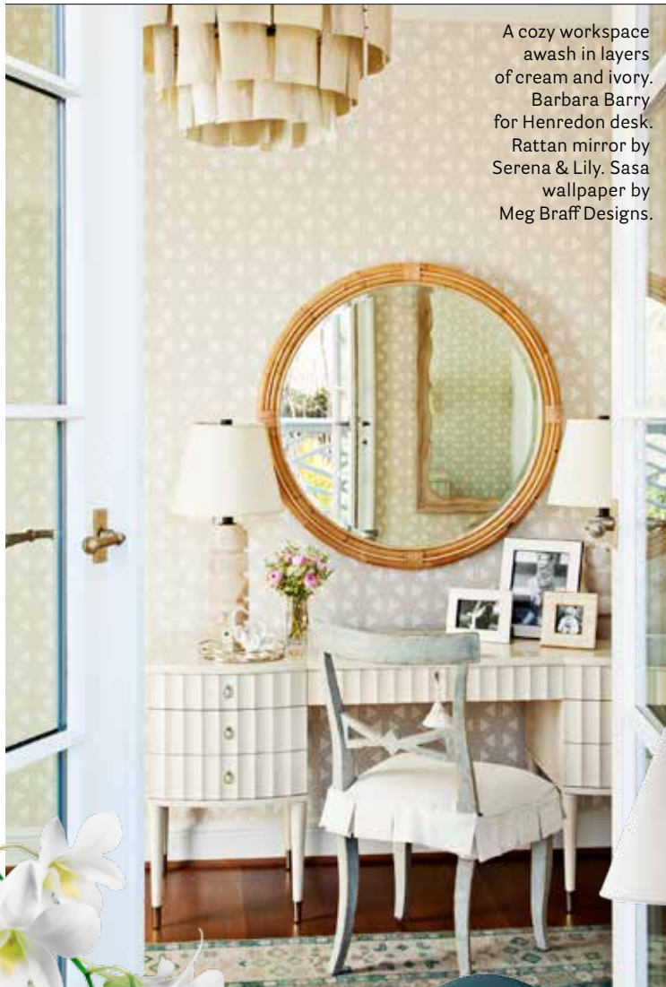
A cozy workspace awash in layers of cream and ivory. Barbara Barry for Henredon desk. Rattan mirror by Serena & Lily. Sasa wallpaper by Meg Braff Designs.