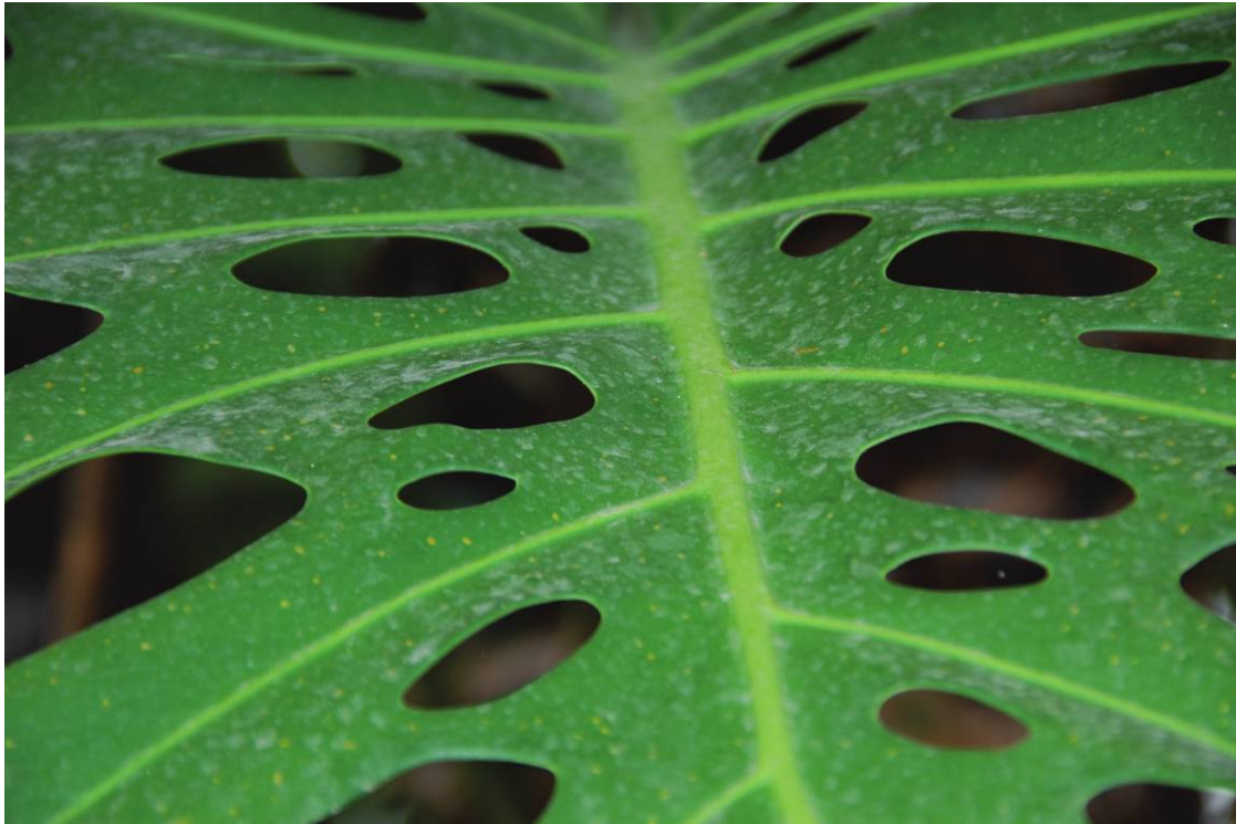
Swiss cheese plant ( Monstera deliciosa ).