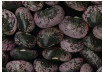
Runner 22 - Kelvedon Marvel (dry and snap bean)