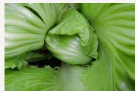
Mustard 17 - Leaf Heading (crisp, juicy, light spice)