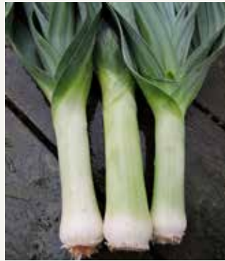
Leek 22 Giant Musselburgh Improved