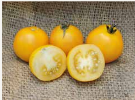
Tomato 4598 Livingston's Gold Ball