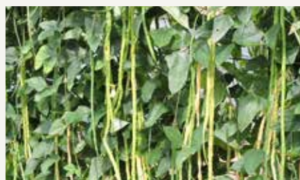
Cowpea 367 - Fagiolini dell'occhio (young pods are tender and fruity)