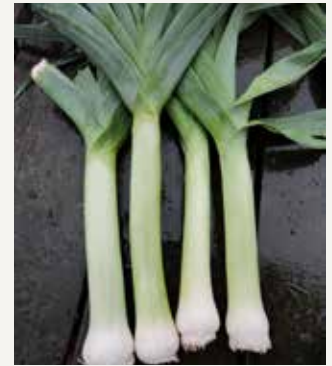
Leek 84 American Flag, Large