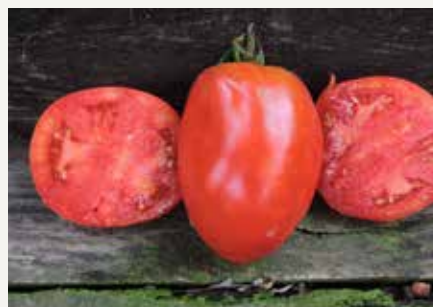
Tomato 6729 - Salvaterra's Select (fresh eating and sauce)