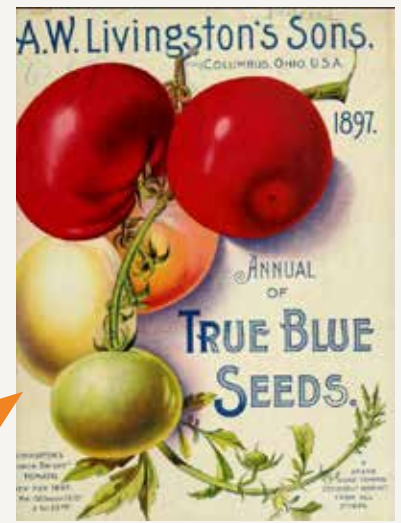
Livingston's Honor Bright matches Tomato 364 - Lutescent