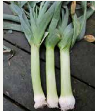
Leek 27 Broad London