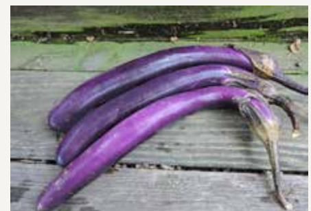
Eggplant 36 - Pintong Long (sweet and buttery)