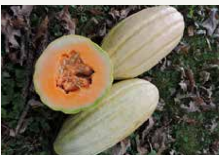
Melon 213 - Perlon (sweet and smooth)