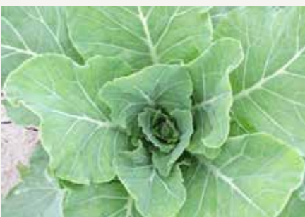
Collard 73 - E.B. Paul (sweet and juicy)