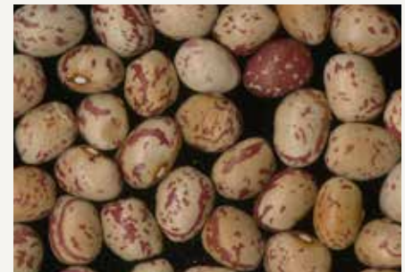
Bean 2196 - Grandma Blank (shelling and dry bean)