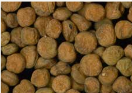
Pea 185 - Dutch Grey (soup pea)